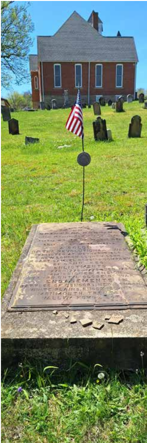
Brintnel Robins gravesite at Harrold Zion Lutheran Cemetery in Hempfield Twp.